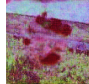
P_{0.5}(w) \rightarrow Q_8(w, f)