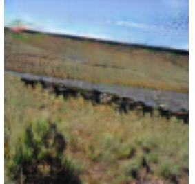
P_{0.5}(w) \rightarrow Q_{12}(w, f)